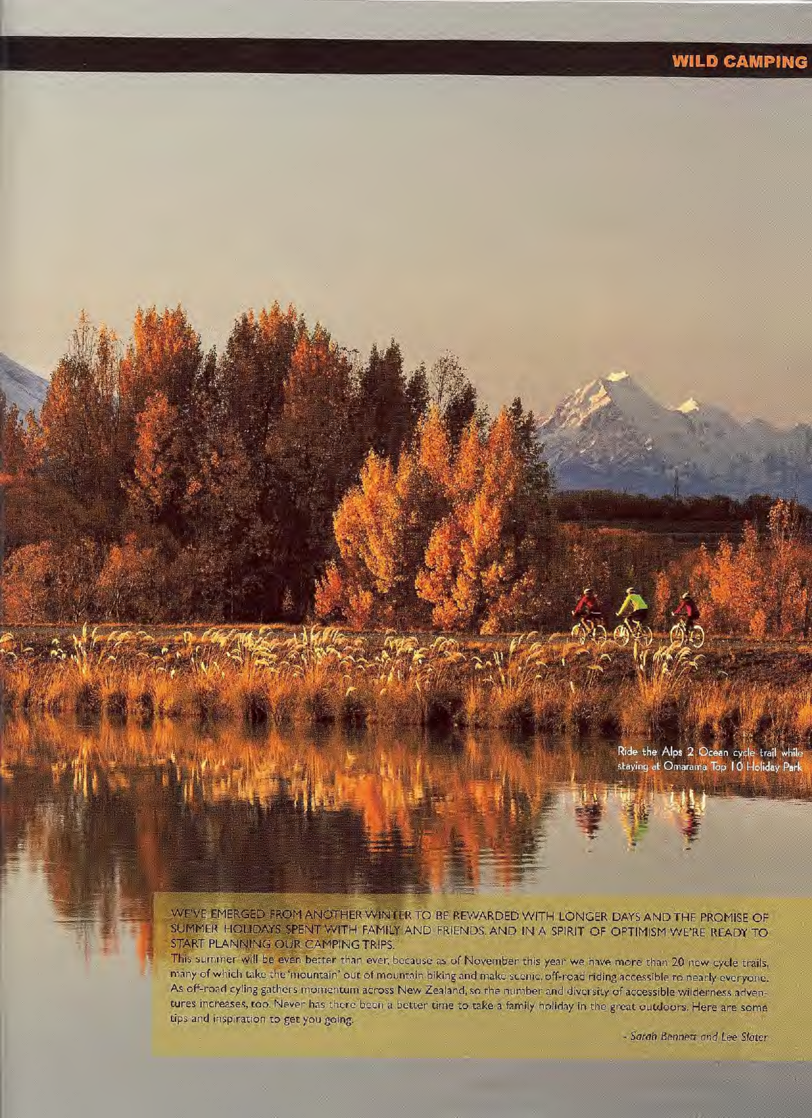
Ride the Alps 2 Ocean cycle trail while staying at Omarama Top 10 Holiday Park

WE'VE EMERGED FROM ANOTHER WINTER TO BE REWARDED WITH LONGER DAYS AND THE PROMISE OF SUMMER HOLIDAYS SPENT WITH FAMILY AND FRIENDS, AND IN A SPIRIT OF OPTIMISM WE'RE READY TO START PLANNING OUR CAMPING TRIPS.